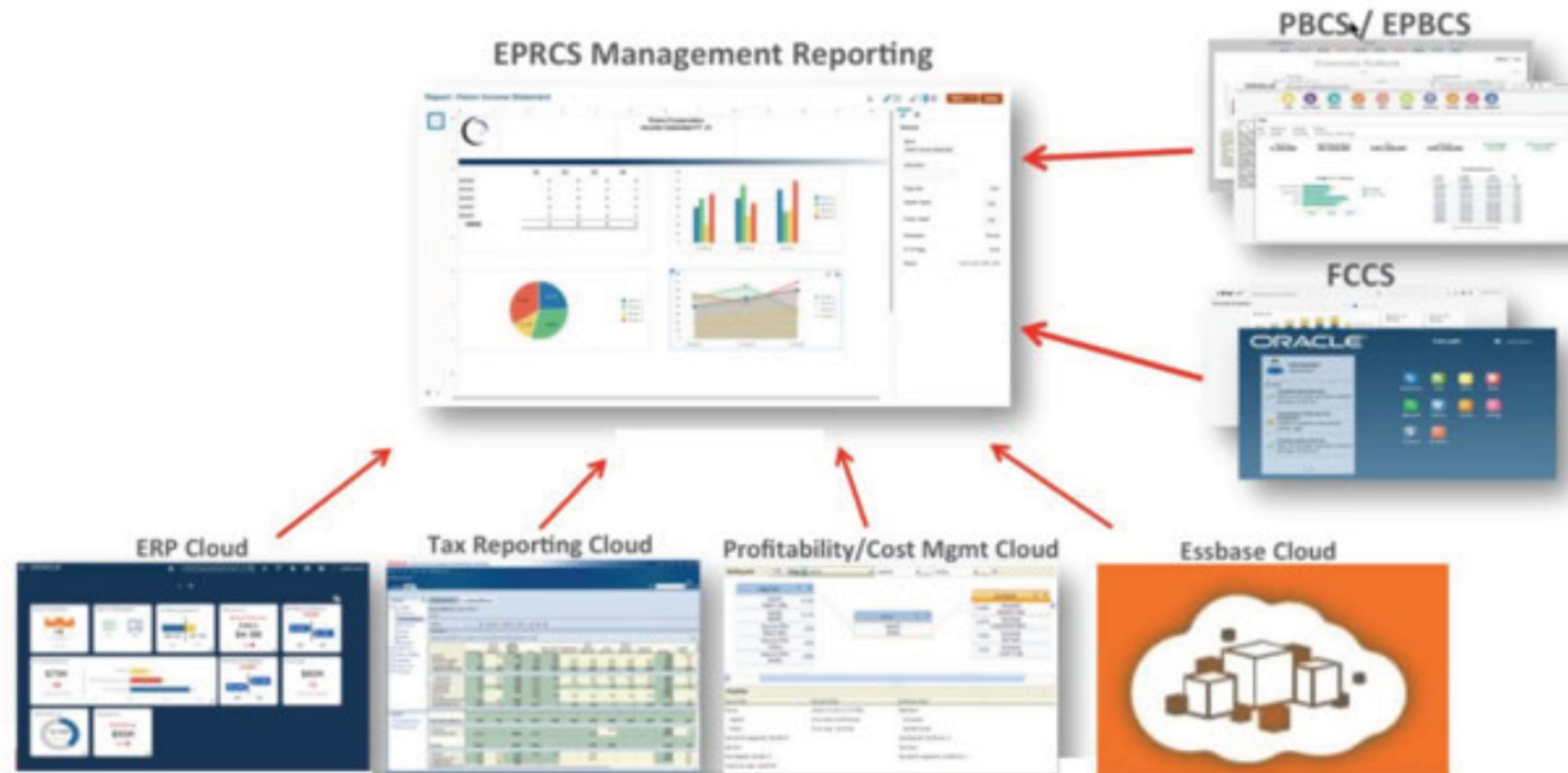
Diagram Provided by Oracle