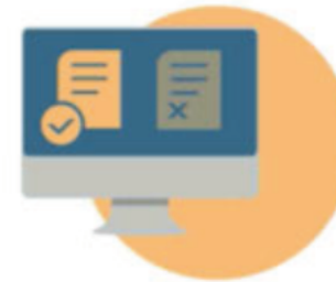
Diagram Provided by Oracle

secure and control access to the report content